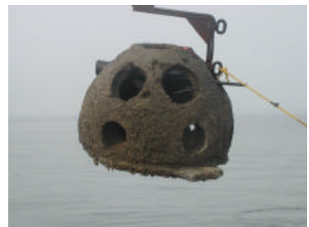
Figure 1 Deployment of Bay Ball with hatchery spat attached at Memorial Reef, October 2002.

The use of the latest generation of designed reef structures with specific biologically oriented features provides a significant improvement over materials of opportunity and earlier designed structures. Reef Balls™ are being integrated into the program as the program standard because their design and performance are supported by readily available engineering, scientific and monitoring data and there is a proven track record in providing value habitat and fishing opportunities in the mid-Atlantic region (e.g., New York, Virginia, New Jersey, and Massachusetts reefs) for benthic organisms, crustaceans, and multiple fish species. Other suitable designed reef structures and materials, as available, that conform to permit criteria are also eligible for